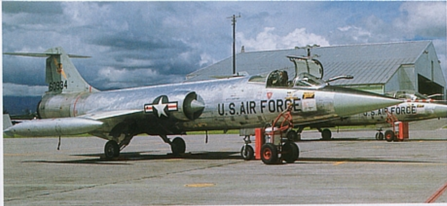
left: The first major deployment of F-104s to Southeast Asia ended in December 1965. This shot was taken at Clark AB in the Philippines in December on the return flight back to the states. These Starfighters were assigned to the 435th TFS. (Darrell Hatcher)

ground attack sorties were in-country close air support (CAS) missions that were under the control of airborne forward air controllers. This brief period opened some eyes in that this pure-bred air superiority type earned high marks for its ability to put ordnance in on specific targets with pinpoint accuracy.