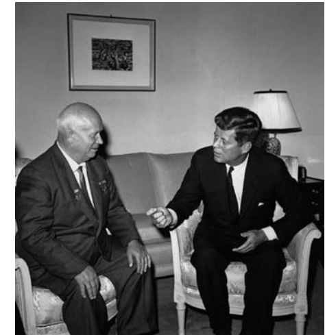
Soviet Premier Nikita Khrushchev, left, and U.S. President John F. Kennedy sit in the residence of the U.S. ambassador in Vienna, Austria, prior to their 1961 summit.

The crisis had been brewing since 1958 but was dramatically escalated during the 1961 summit in Vienna between President John F. Kennedy and Soviet Premier Nikita Khrushchev. At that meeting, Khrushchev demanded an end to Germany's divided condition as well as a resolution to Berlin's status as an occupied city. Otherwise the Soviets would sign a separate peace with East Germany, which would dissolve the NATO countries' access rights to Berlin. The importance of Berlin was highlighted in part by the fact that East Berliners were migrating to West Germany through the western sector of Berlin by the thousands, a humiliating indictment of the communist system. 7 Dean Acheson, a special advisor to Kennedy on European affairs, warned the president of Berlin's importance to the United States and argued that "the prestige of the United States and perhaps its very survival" were at stake.