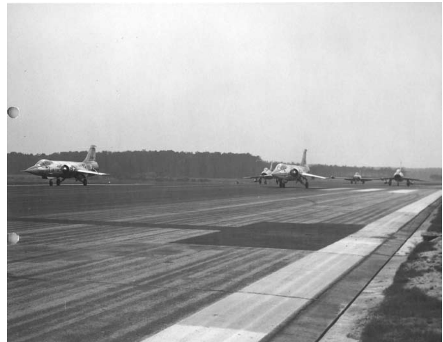
F-104 Starfighter from the 151st landing at Ramstein, accompanied by a French Mystere IV.

capability . . . organized, trained, and inspected exactly like our active duty units. Our ANG units . . . [are] capable of instant action.” 43 As for the capabilities of the 134th Fighter Group, given time to maintain its jets and train adequately, it was a very good combat unit that was ready to fly, fight, and if necessary deploy overseas. It did not have the ability, however, to quickly sustain flight operations from an overseas base once it got there. After a number of weeks, once it settled into a routine at Ramstein, it out-performed its peers. It did the same, given time, after it returned to Alcoa. It met the standards for combat readiness that Air Defense Command set about a month after coming back to the United States.