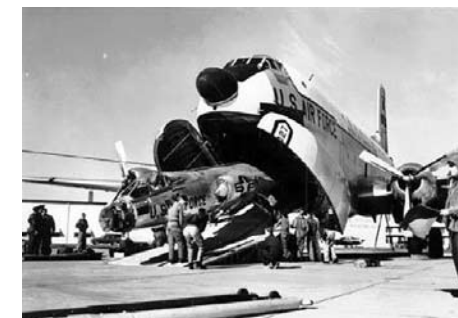
F-104 Starfighter, dismantled and being loaded for transport.