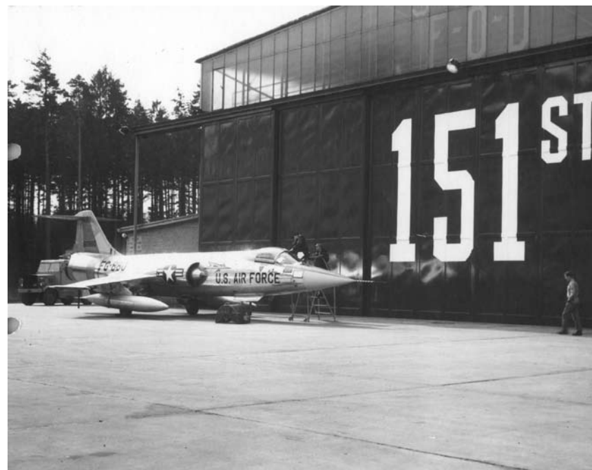
F-104 Starfighter in front of the 151st hanger at Ramstein Air Base, now with USAF markings.

but that rating fell to "C-2, operationally ready" the next month because it did not have enough aircraft. 33 Major Aiken found that efforts to extend the endurance of the F-104s through the use of under-wing fuel tanks hurt morale and prevented pilots from flying the aircraft to the limits of what it was made for—speed. "It was our belief that the satisfaction of operating the aircraft in its best environment—the high supersonic attacks [sic]—is a contagious spirit that spreads throughout the unit, and ultimately affects the morale of every man." 34