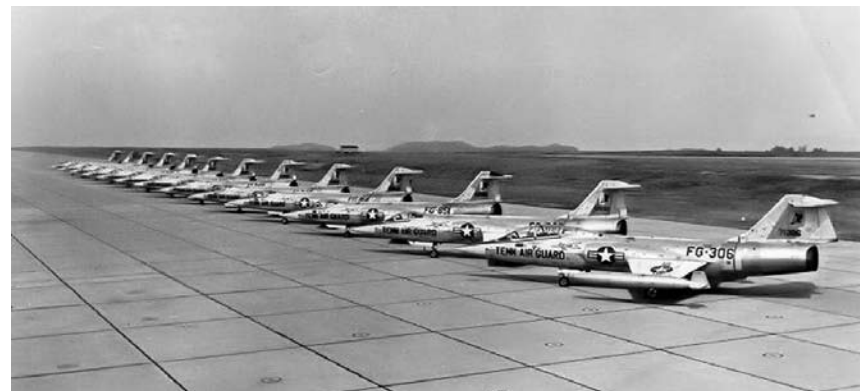
F-104 Starfighters from the 151st Air National Guard, their “TENN AIR GUARD” markings still in place.

Lockheed was proposing equipping the F-104 with the capability of dropping a nuclear bomb, just in case the Air Force needed it to do so in an “emergency,” citing its exceptional speed as an asset for this bombing mission. Although originally intended as a weapon against rival Soviet fighters, the Starfighter first entered service with the Air Defense Command in 1958, which wanted 157 of the jets for continental defense against Soviet bombers. These would serve as interim interceptors between the F-102 and F-106. Its speed and climbing capability would ensure that no Soviet bomber could escape from it, but the Air Force soon realized that it had tasked the ‘104 with a mission it was ill-suited to perform. Starfighters lacked the internal space for the avionics necessary for an air defense interceptor, and it could not carry the radar or fire control black boxes required for radar-guided missiles for finding and shooting down aircraft at night. There was no way it could destroy a bomber which escaped into cloud cover. Lockheed even tried to persuade the Air Force to purchase an improved all-weather version which would utilize as its main weapon an MB-1 “Genie” air-to-air rocket with a nuclear warhead, but the Air Force opted to stick with the F-106 as its penultimate interceptor. Thus the Air Force transferred its F-104s to the Air National Guard after just two years of active duty service. 25